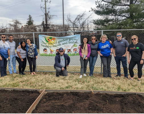
(Top) Volunteers from Nemours ready the garden at Carrie Downie Elementary.

(Bottom) Volunteers from Adesis, Inc. clean the garden at Pleasantville Elementary.