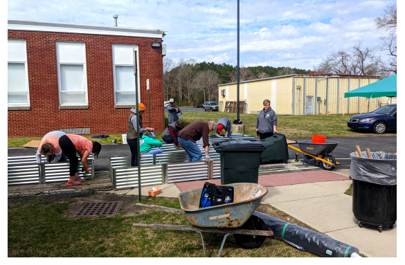
Volunteers and staff from John Clayton. build their new garden, April 1, 2022.